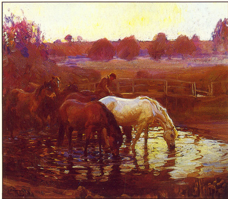
Sir Alfred Munnings, P.P.R.A. 1878 - 1959